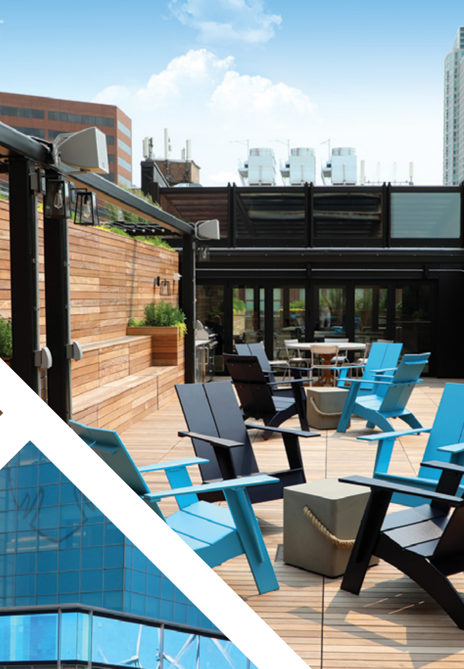
FiveBelow, Philadelphia, PA