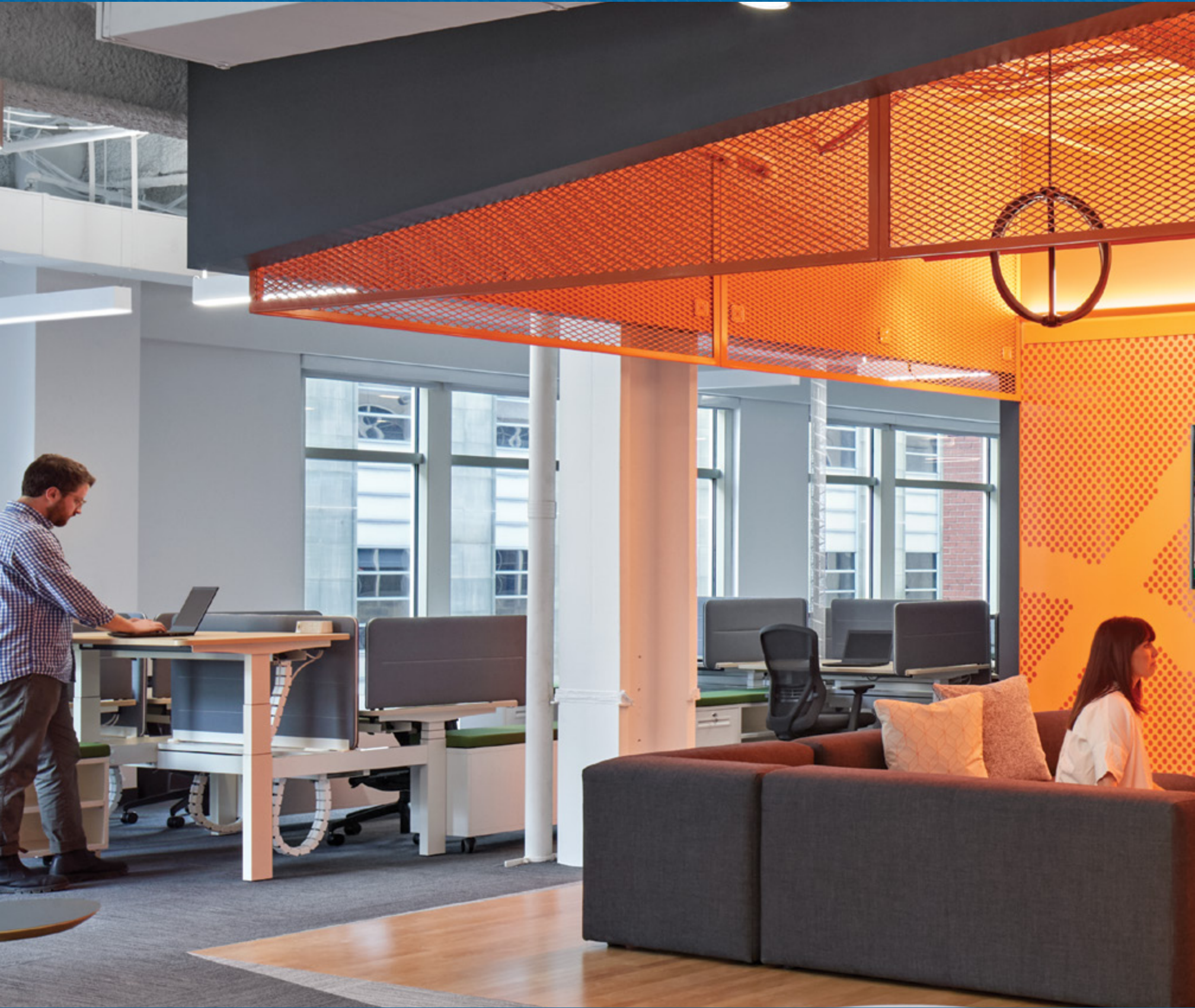
DraftKings