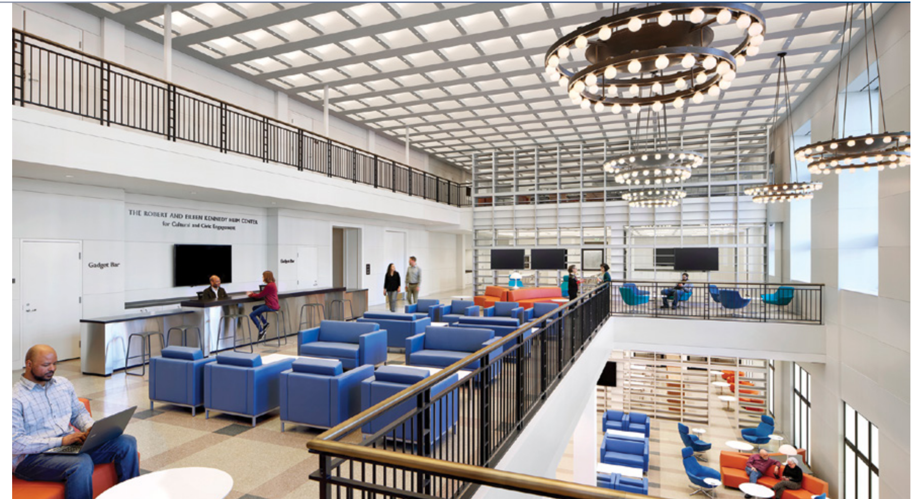
Above ▲ The lattice ceiling and walls echo the original shelving of the stacks

The historic building now offers abundant public meeting and working areas