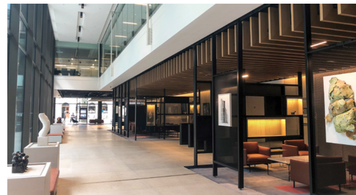
Above ▲ Ashurst LLP

Despite the indisputable need for private workspace within a law office, flexible and open layouts are being embraced by some of the industry's global leaders. With these top law firms paving the way, agile workspaces in the legal sector are definitely here to stay. ◀