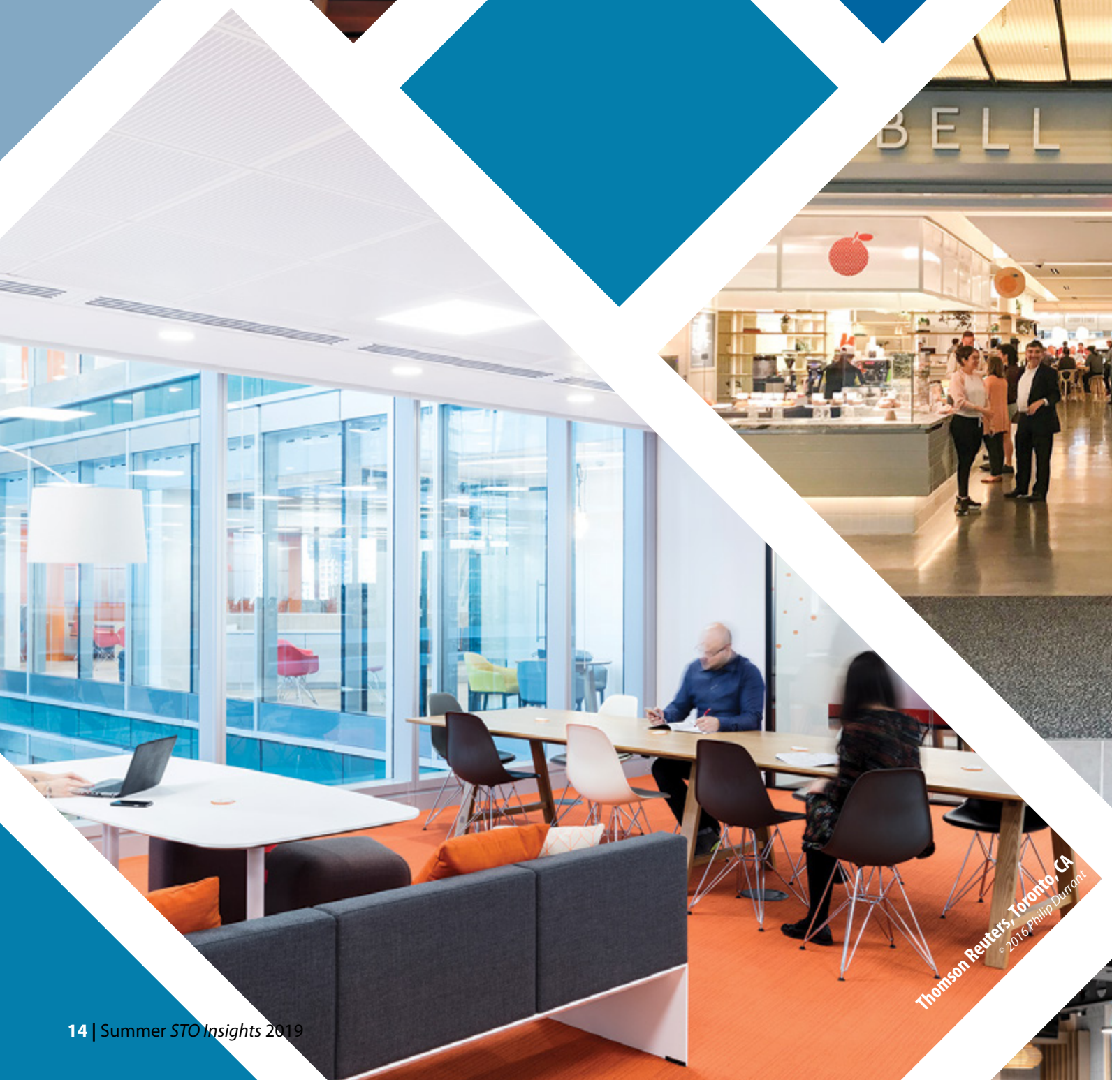
Thomson Reuters, Toronto, CA