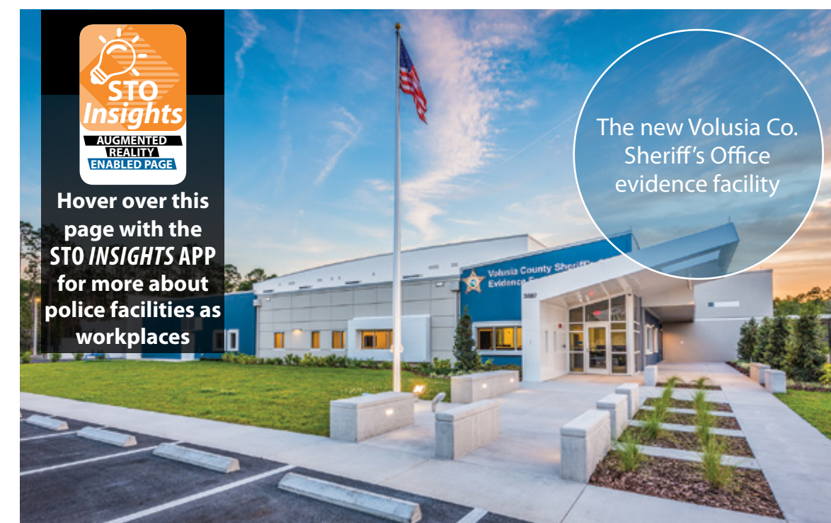
The new Volusia Co. Sheriff's Office evidence facility