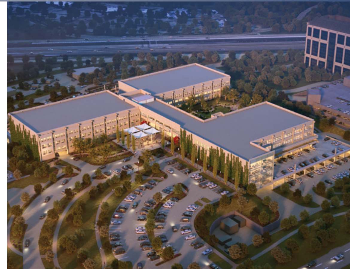
Above ▲ VARIDESK converted the former Zales HQ into a flexible office complex

Updating the space included adding amenities like outdoor spaces