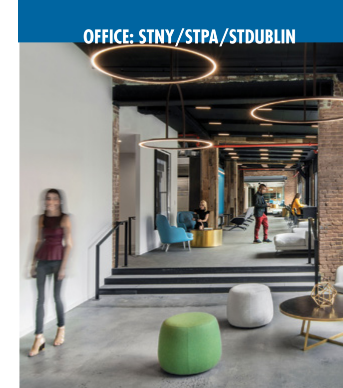
Above ▲ Collaborative spaces are key at (L to R) AIB Molesworth (Dublin), NELSON HQ (Philadelphia) and Argo (NYC)