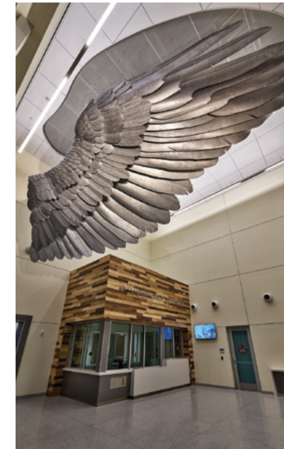
Above ▲ The new St. Petersburg facility features a 30-foot eagle's wing, illuminated at night

"At their previous facility, someone on the evidence team would have to come in at all hours of the night to receive evidence," says Cox. "This addition helped change the culture a bit to ac-