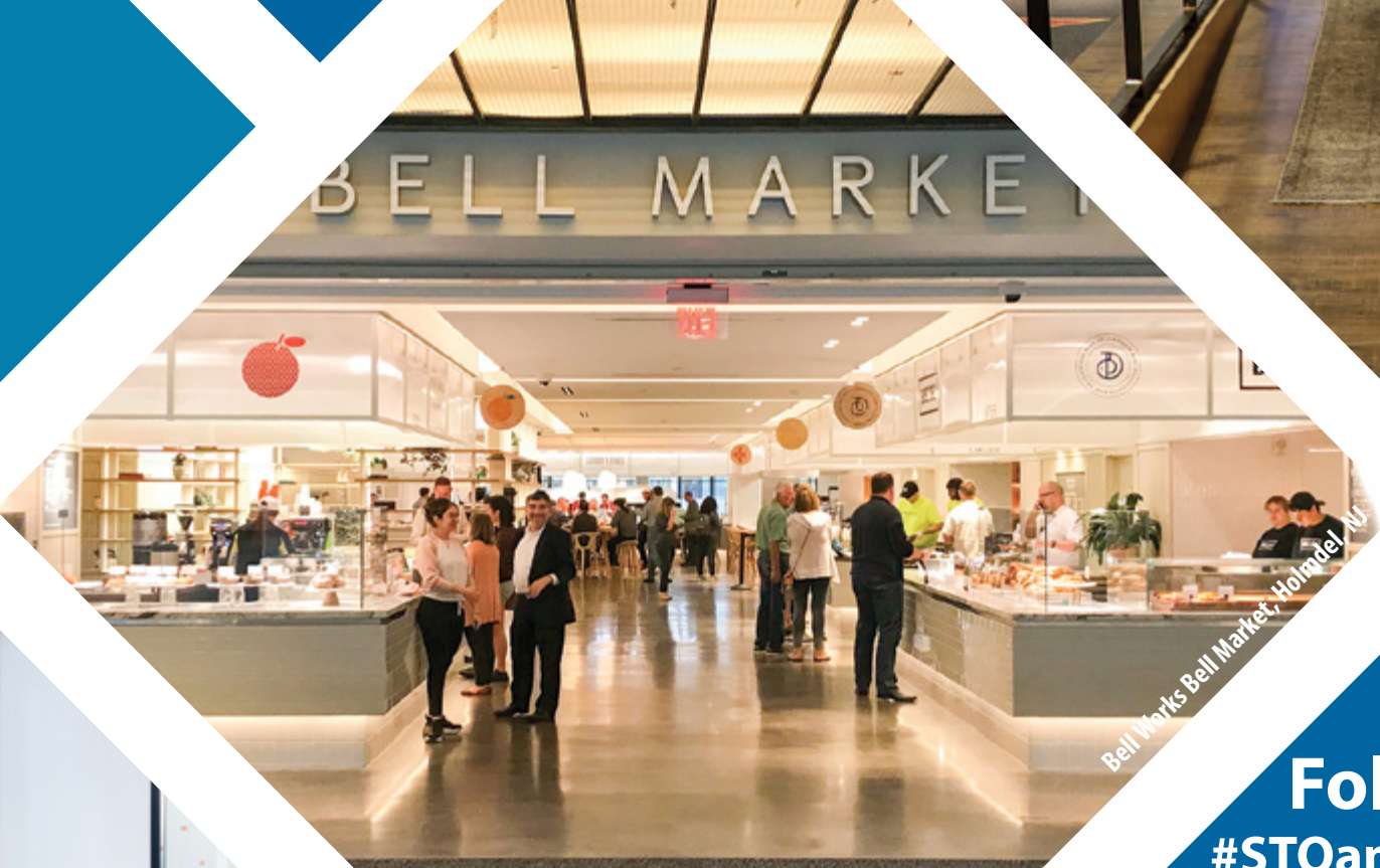
Bell Works Bell Market, Holmdel, NJ