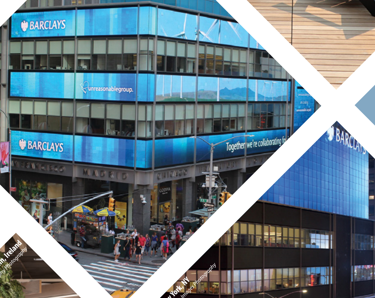
Barclays, New York, NY John Beer Building Image Photography