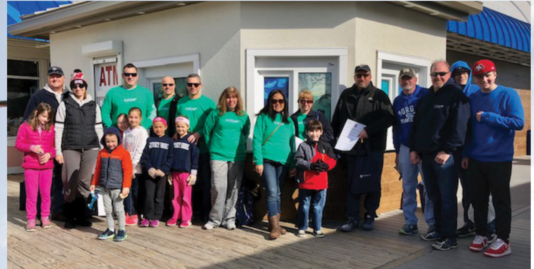
Above ▲ Newark Urban Farm

While there's certainly been a lot of progress, when it comes to plastic reuse and recycling, the United States still has some work to do. According to the National Geographic Society, shoppers in the US use almost one plastic bag per day, compared to Denmark, where, on average, residents use four plastic bags per year. In fact, the Environmental Protection Agency reports the US only recycles 9% of its plastic, leaving plenty of room for improvement.