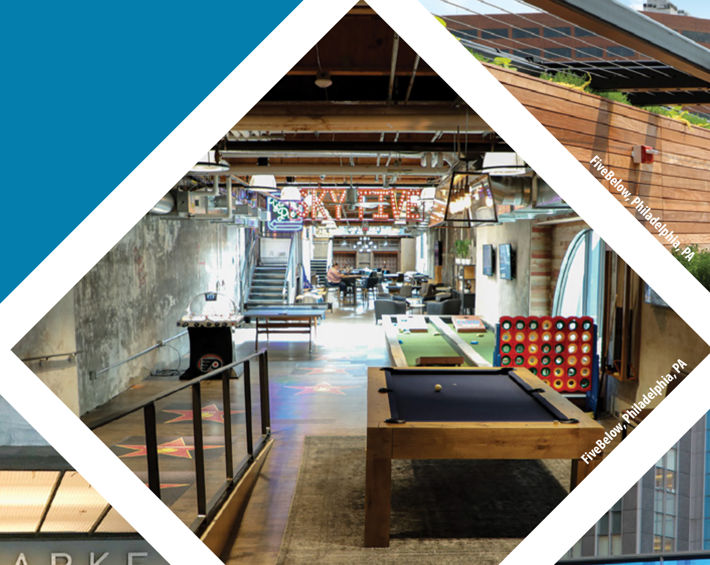
FiveBelow, Philadelphia, PA