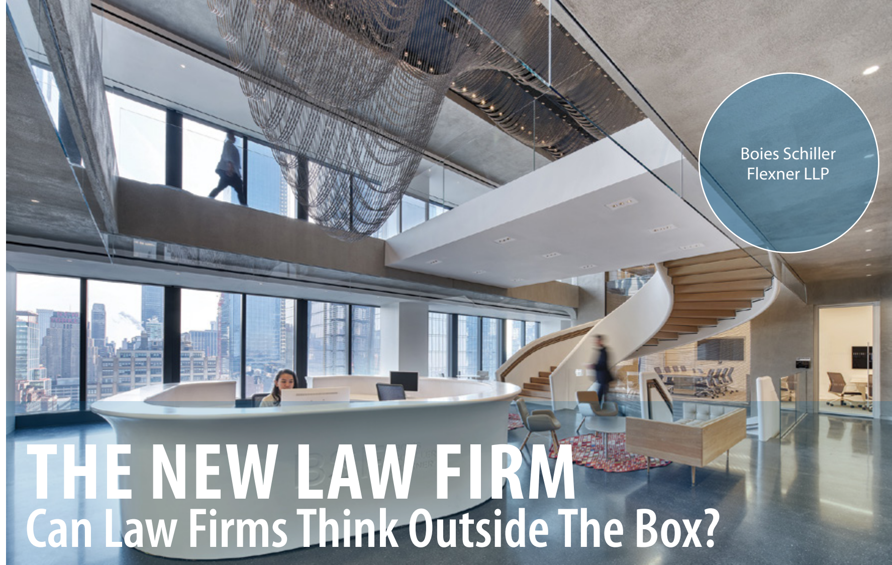
Boies Schiller Flexner LLP